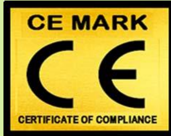
CERTIFICATE OF COMPLIANCE