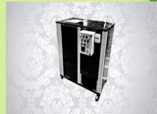
WC 70 Actual Picture