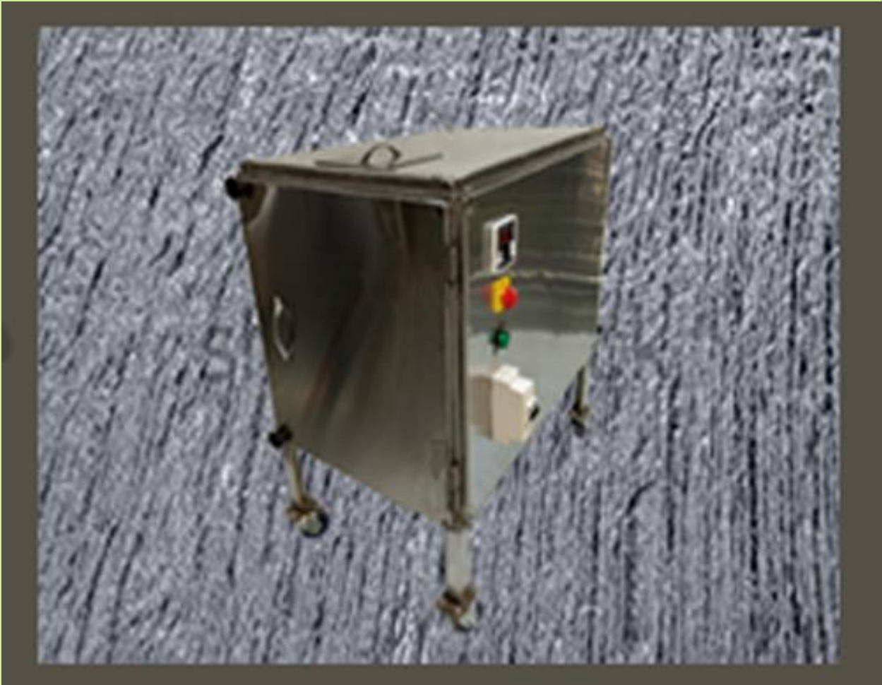
COMPOSTO 10 SS